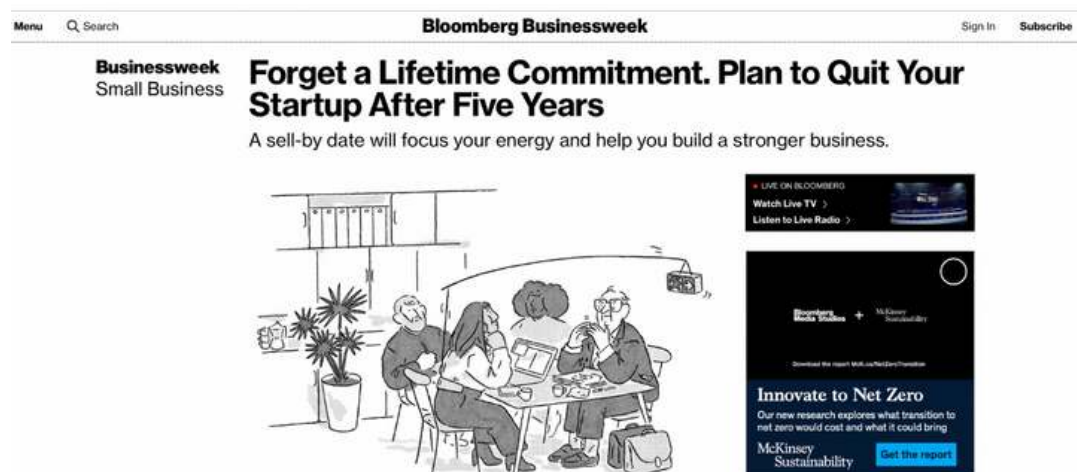
We get regular media coverage from sites like Bloomberg and TIME