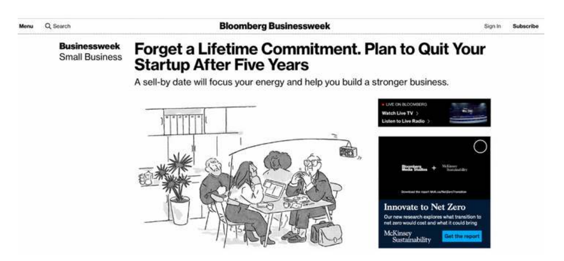
We get regular media coverage from sites like Bloomberg and TIME

And this is just the beginning! Traffic keeps increasing month by month and we keep optimizing and improving our strategies so that LuisaZhou.com will soon be generating 7-figures and beyond from search engines.